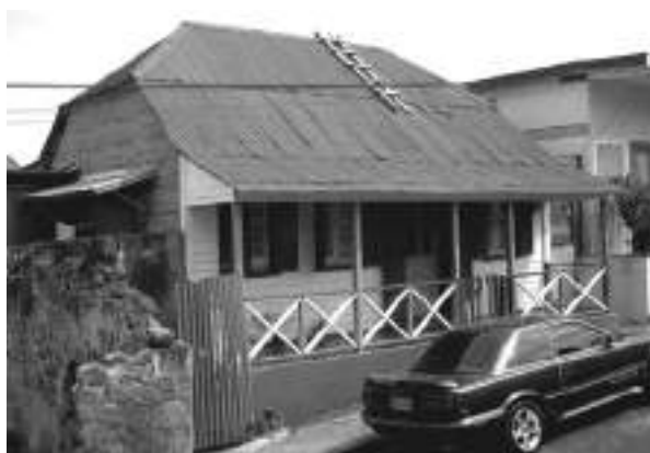
Fig. 2: A French Creole residence/commerce

them from tremors and high winds. According to Berthelot and Gaumé in Kaz Antiye (Caribbean Popular Dwelling) , 19 Dominica's roof shapes tend to be half-hipped gables, as shown in Fig. 1, which are well braced for hurricane winds.