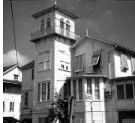
Georgetown's vernacular wooden architecture

The expert meeting attempted to differentiate between wooden architectural heritage, comprising various architectural expressions in wood including stand-alone grand monuments in rural areas, and wooden urban heritage: the focus was on the vernacular architecture clustered in urban ensembles of sufficient size,