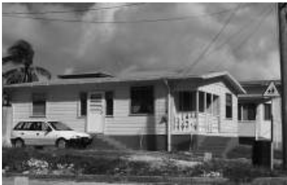
Fig. 3: Contemporary wooden bungalow, with integrated kitchen, toilet and bath

Despite the partial 'concretization' of the modern chattel house, the lingering image (usually seen on picture post-cards) is one of a charming, vividly painted structure with curtains flying through windows surrounded by shutters, hoods and detailed trellis and fretwork. The chattel house has survived what I would call the 'concrete period' and has settled down for the time being as a wooden bungalow. The kitchen, toilet and bath have been totally integrated, and increased use of glass in the windows lets much more daylight into the house (Fig. 3).