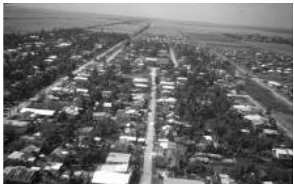
The outskirts of Georgetown, where former plantations are being converted into urban neighbourhoods

Georgetown is a typical planned city: no indigenous settlement existed at the mouth of the Demerara River before the decision was made to found a settlement, a strip of land for public functions was reserved and a town plan prepared. The flat, clayish and fertile lowlands at the mouth of the river were divided into numerous rectangular plantations, separated by dams and drainage canals