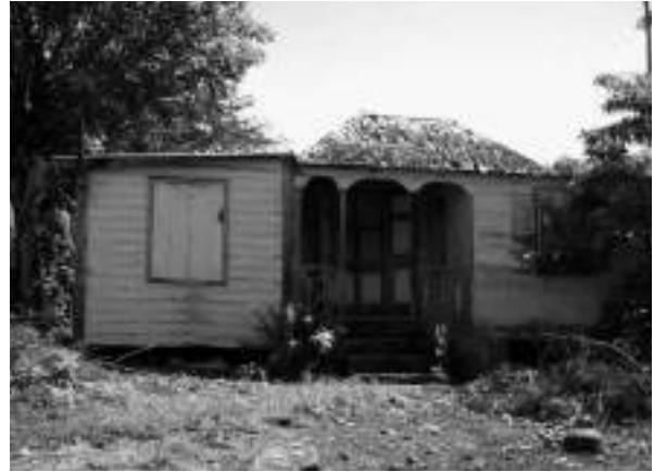
Local vernacular exuding quaintness, charm and imagination

This desire for larger homes has been fed by the introduction to the Caribbean of concrete as a building material.