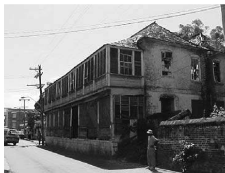
Creole Landscape, Spanish Town, Jamaica

Both Creole and Vernacular are the most significant categories of the cultural landscape of the wooden urban heritage in the Caribbean. Creole represents the distinct local spirit of the Caribbean that contains a mixture of European, African and Amerindian peoples. This landscape dominated from around the 1780s, the period of Peace Treaties and cessation of territorial wars between the European powers in the Caribbean region. It lasted until after the period of the emancipation of slavery until about the 1840s.