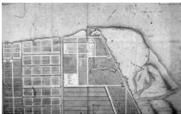
Plan of Georgetown (1798)

The conversion of the low-lying, fertile clay banks surrounding the Demerara River into plantations required large civil engineering structures, consisting of canals running perpendicular to the river and high dams (back and front) parallel to the river. The canals were used to drain the water surplus of the hinterland into the river through sluices, which were opened during low tide. The frontdam or dyke supported a road connecting the different plantations. This system of canals, sluices and connecting damroad defined the urban layout of Georgetown and they are still essential visual characteristics of the city. Georgetown's most important streets, High Street in Kingston, Main Street in Cummingsburg and Avenue of the Republic, originate from the ancient connecting damroad.