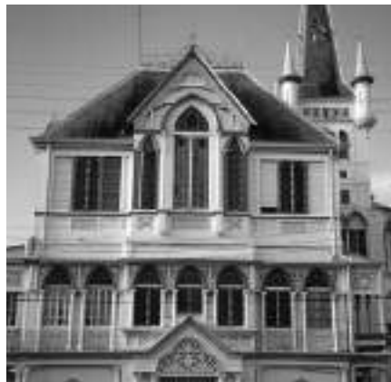
Georgetown's City Hall: an extraordinary example of Gothic architecture in a tropical context, executed in wood with cast-iron elements

rich tapestry of the Caribbean's architectural heritage is the wealth of vernacular structures, which reflect the development of the social order of the region. From simple case and 'chattel' houses, like those on Antigua and Barbados, to elaborately embellished town or country residences, like those on Haiti and Guadeloupe, true Caribbean architecture contrasts with those early buildings, which replicate traditional European styles. It is in the detail of these locally designed structures that we see how the influence of European architecture has been adapted and refined to suit the needs and climate of the tropical Caribbean'. 2