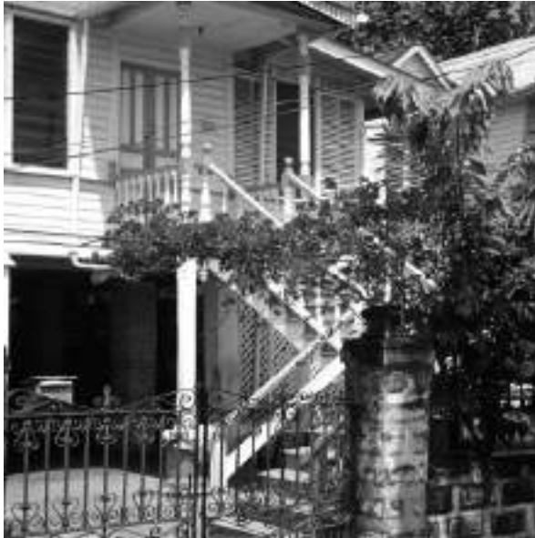
A wooden house on brick stilts, richly decorated and well-maintained, Georgetown (Guyana)

important aspect of the region's built heritage: that parallel economic development under the same colonial powers, resulting in a similar material culture including urban and architectural heritage, does not automatically mean that this cultural heritage is identical. Thorough research, documentation and analysis reveals the uniqueness, the specific characteristics and distinct differences that exist between these two similar properties.