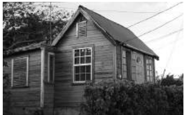
A chattel house in design transition, where there are varying window types: jalousie, sash and double-hung glass. The entrance door is also on the move.

Concrete additions housing shower, bathroom and sometimes kitchen facilities have increasingly become the norm.