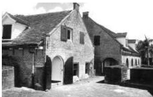
Fort Zeelandia Complex in Paramaribo (1667)

In Paramaribo the most important listed monuments are Fort Zeelandia and its surroundings (dating from 1667), the Presidential Palace (1730), the Ministry of Finance (1841), the Roman Catholic Cathedral (1885), 'Cornerhouse' (1825), De Waag (the Weigh House, 1822) and the Reformed Church (1837). Larger buildings, such as the Ministry of Finance and the Court of Justice, were designed by Dutch architects employed by the colonial government. They were built according to the existing architectural style in the Netherlands combined with local construction traditions. The wooden vernacular houses were designed and built by local craftsmen, including free blacks, and entirely reflect the Surinamese style.