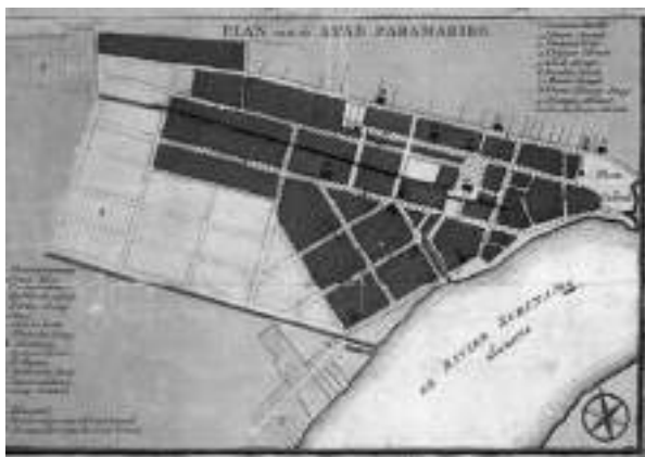
Plan of the City of Paramaribo (c. 1700) Dutch General State Archives, The Hague

The inner city of Paramaribo, the part which is now inscribed on the World Heritage List, was laid out behind Fort Zeelandia surrounding a military parade ground, currently named Onafhankelijkheidsplein (Independence Square). Next to being a parade ground, this square provided for an open field of fire in front of Fort Zeelandia, a common strategic feature in colonial city planning. The city was laid out westwards on shell ridges, which are remnants of ancient times when the ocean reached this far inland. These ridges consisted of stable soil with natural drainage and made good construction sites. From the mid-eighteenth century the city was extended southwards on the sandy banks of the river. By constructing canals with sluices and canalizing existing creeks, the wider area around Paramaribo was drained to keep the city dry and make more land available for construction. In between these canals the land was subdivided into regular and standardized plots according to egalitarian principles. All this resulted in a rational town plan, which followed the natural lines of ridges and creeks and the curves of the river.