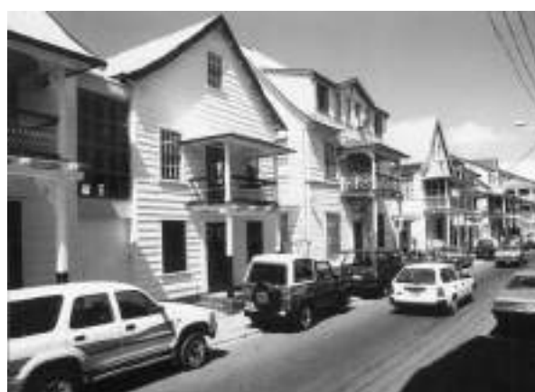
Historic streetscape in the inner city of Paramaribo

Uniformity, derived from the dominant use of timber and a strict adherence to the prevalent style, is typical of Paramaribo architecture. The majority of wooden houses, both large and small, are similar and built after the same basic design: a rectangular layout, plain symmetrical walls, a high-pitched roof, red brick substructures as basement, with white façades and green doors and shutters. By painting the wooden walls white and the brick elements red, form rather than material was emphasized, a Dutch tradition. Extensive use of symmetry in the layout of buildings, in groundplan and façades, gives further clarity and simplicity.