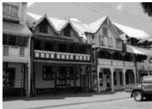
Streetscape along Brazil Street opposite Derek Walcott Square

The wooden rendition of classical structures in Soufrière was a marvel. Collectively these structures formed a streetscape flaunting their elaborately adorned eaves and banisters, overhanging balconies and jalousies all secured with intricate pegged bracing. As time passed, many events would impact on Saint Lucia's built environment. The devastating hurricane of 1780, the civil unrest in 1795 prompted by the French Revolution, the loss of cheap labour due to the complete abolition of slavery in 1838, and the fire of 1955 resulted in a close to barren architectural heritage resource.