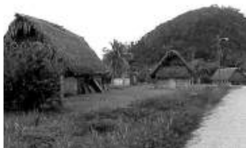
Amerindian Landscape, Belize

Aboriginal/Amerindian describes the cultural landscape of the Amerindian people prior to 1492. It is very important to note that in some rural settings this environment is still evident today, such as on the island of Dominica and in Belize.