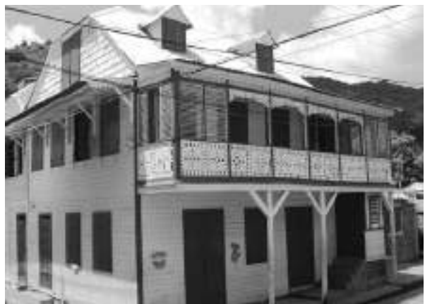
Caribbean Vernacular architecture