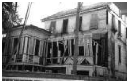
Chess Hall in Georgetown (Guyana): situation in 2002, it collapsed soon after and has disappeared from Georgetown's historic streetscape

wooden heritage still present in the Caribbean region and exchange information on issues of protection and conservation. Furthermore, part of the meeting aimed at debating the role of this heritage in strengthening cultural identity, both of individual islands and the Caribbean region as a whole, and what opportunities exist in terms of sustainable development, in particular for tourism.