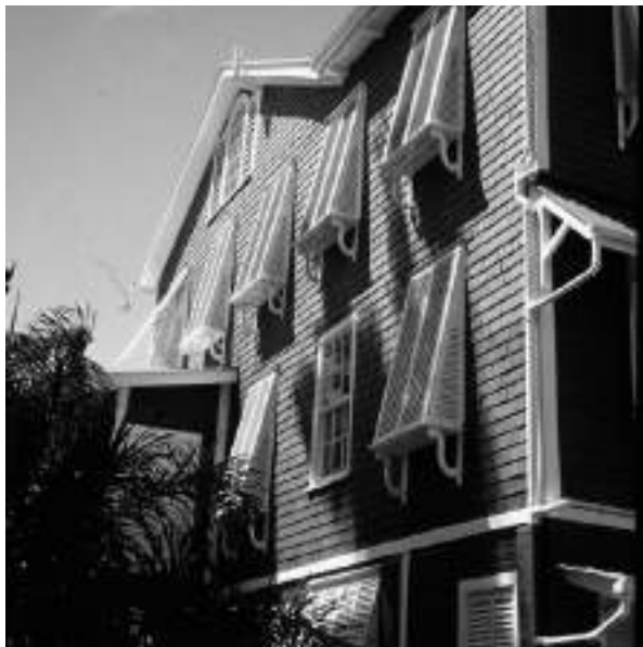
Demerara windows of the Red House, Georgetown (Guyana)

Georgetown, on the other hand, as a primarily British colonial ensemble, is characterized by the remarkable combination of architectural styles, which are mostly nineteenth-century European in origin, such as Gothic, semi-Tudor, Romanesque or Italian Renaissance. Exceptionally, all have been executed in wood, always easily available and as a light material well-suited to the load-bearing capacity of the clay soils. Even within the vast British colonial empire this unique aspect is virtually unmatched: 'Georgetown ... home to some of the most exuberant Victorian architecture in tropical and subtropical climes'. 17 The wood used during British colonial times was a mixture of hardy local greenheart and pine imported from North America, which came as ballast in the ships that transported the famous Demerara sugar. The buildings, which also reflect major influences from the West Indies in response to the particular climatic conditions in Guyana, refine Georgetown's distinctive character: the architectural heritage is a blend of styles and a true example of 'mutual heritage'.