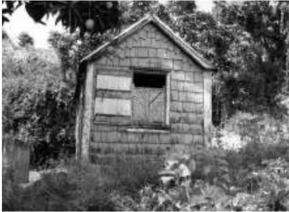
Local vernacular presenting the scale, the culture and the charm of the past