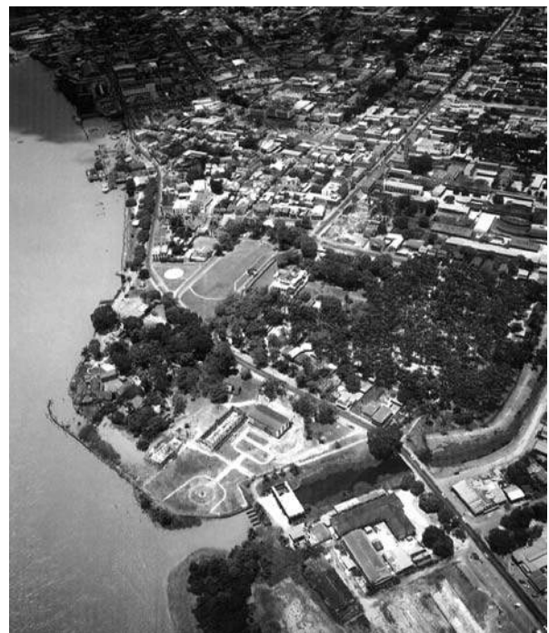
The Fort Zeelandia Complex on a protruding point on the left bank of the Suriname River with Independence Square and the historic inner city behind it

After the takeover of Suriname from the British in 1667, the Dutch built the brick Fort Zeelandia on the site of the former British wooden Fort Willoughby, on a protruding point on the left bank of the Suriname River, to guard incoming ships. Paramaribo was developed on a site where initially an indigenous village had existed, with streets containing warehouses, bars and brothels lining the harbour front. In 1683, after the colony came under the command of Suriname's first Governor and co-owner Van Sommelsdijck, the proper layout of the city was