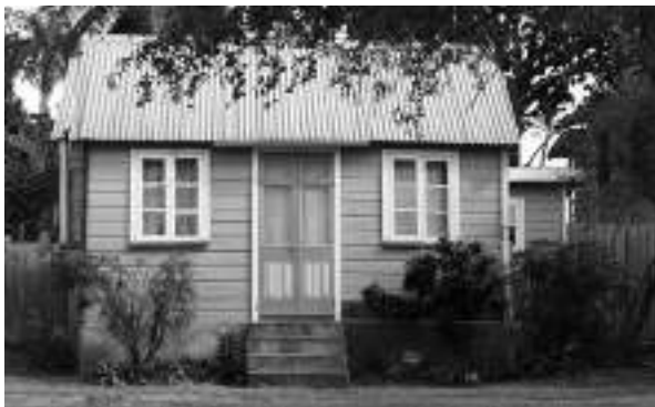
Fig. 1: Typical chattel house in near-perfect symmetry

The key to the design of the chattel house is near-perfect symmetry (Fig. 1). A typical feature is that it is almost always constructed with a central door on the long side, facing the street, with a window on either side. The roof is gabled (two slopes) or hipped (four slopes). Bathroom and cooking amenities were not incorporated in the main structure during the early days of the chattel house (Fig. 2).