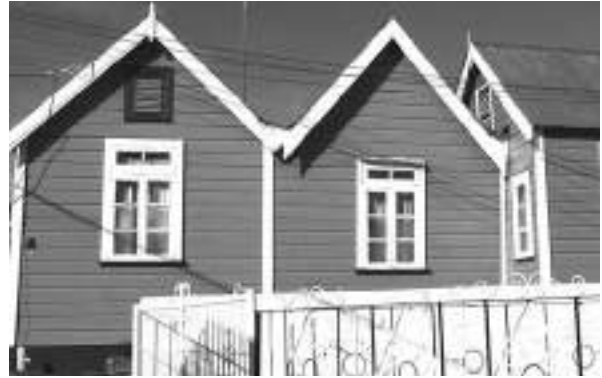
Fig. 4: Contemporary use of the chattel, a home-owner's pride and joy

Collective efforts have been made to conserve and promote this unique use of timber in Barbados, with the Barbados National Trust in the forefront. Architects today have been referencing the unique qualities of the chattel house, and commercial/business enterprises have also been supporting this effort through adaptive reuse. These efforts have also been supported through the endeavours of many proud home owners, as seen in Fig. 4, as well as bungalows of greenheart which can better withstand the elements and are more cost effective.