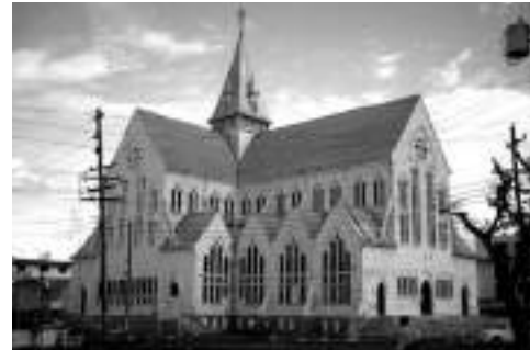
Georgetown's St. George's Cathedral (1892) is entirely constructed in wood

As a result of inadequate protection and questionable restoration practices, wooden urban ensembles were increasingly breaking down. However, positive cases were presented. For example, in Dominica flexibility and creativity allowed the characteristics of the town