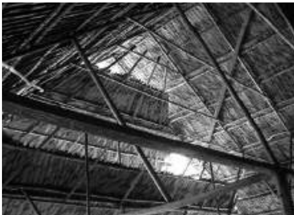
Author's work in Santa Mission, 2002

Perhaps similar to approaches advocated by ICCROM and other international conservation agencies, CAHRD recognizes that the first level of conservation is associated with knowledge. Knowledge entails documentation as a fundamental aspect for preserving cultural heritage. Architectural records aim at conserving this fragile cultural heritage as one of the major challenges of our time. Architectural records, and recording and information management in the field of conservation of indigenous works and those closely related, are continuously being developed and must be considered in the context of a system and as a fundamental part of a larger body of knowledge and disciplines converging to preserve heritage.