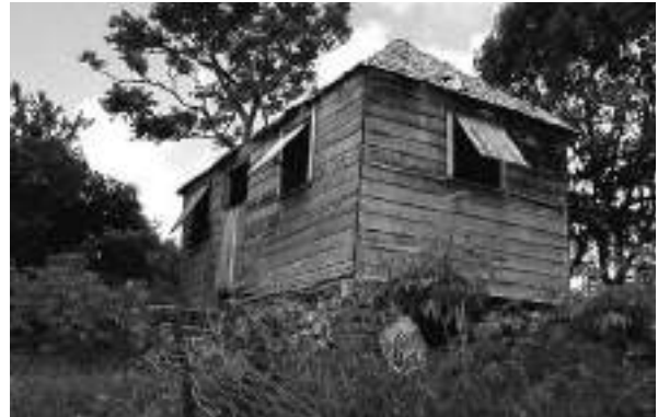
Fig. 2: Main structure of a chattel house of the early days

a roof made from wooden shingles would be entirely timber (Fig. 2).