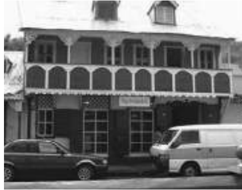
Typical townhouse in Soufrière (Saint Lucia)

Two urban areas noted for their structures are Soufrière on the south-west coast and the capital Castries, on the north-west coast. Soufrière was the first seat of colonization for the French in 1744. Applying the concept of the urban grid with an open space as the major focal point, settlement took root. The many low-rise wooden town houses along the narrow streets complemented the public square, collectively promoting a qualitative and aesthetic dimension of living. These town houses, belonging to estate owners in the outer districts, were typically similar in function. The ground or parlour floor was reserved for commercial use with the living spaces on the upper floors. Also typical of these structures were their basic design concept and proportion, with generous balconies supported by wooden columns forming a natural portico that sheltered patrons along the sidewalk.