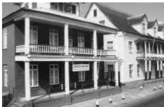
A section of Gravenstraat in the heart of historic Paramaribo (Suriname) that was destroyed by fire some months after this photo was taken in 1996

For the implementation of this activity a co-operation was established with CARIMOS, which was created in 1982 as a ten-year project by the Organization of American States (OAS) and transformed into a regional non-profit organization in 1994. Pursuing its initial goal to identify and study the historic monuments of the Caribbean region, CARIMOS has contributed to training activities, published the findings of its research