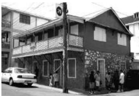
Fig. 1: A 'Ti Kai' with hipped roof and small verandah

Civic and industrial buildings, many of which remain today, consisted mostly of local stone, providing cool and stable shells in which to work. Some residential buildings in town, especially the European-influenced ones, were also constructed completely of stone and some used the bricks that came in as ships' ballast. More typical in Roseau however are the small wooden 'Ti Kaz' residences (Fig. 1) and the French Creole buildings (Fig. 2). The latter consists of an upper storey in wood, encircled by a verandah, on top of a solid masonry ground floor which housed a commercial outlet for the residents above. Wooden construction used local hardwoods which have natural resistance to moisture and termites, and elastic properties protecting