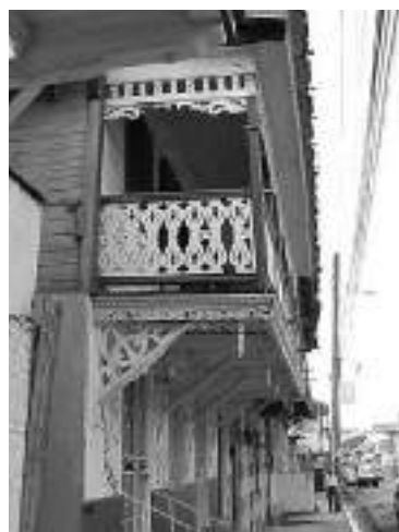
Vernacular Landscape, Roseau, Dominica

Vernacular originated from about the 1840s, after emancipation, up to the end of the First World War and into the 1920s. The vernacular is the most picturesque and ornate category of the ensembles, distinctively neither Amerindian, Colonial nor Creole, and was born as a 'new' Caribbean expression.