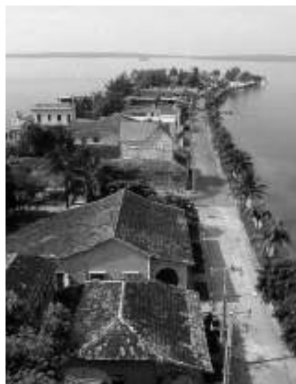
Wooden ensembles along Cuba's coastlines, Cienfuegos

Another type of wooden urban ensemble that grew up in the first decades of the twentieth century are the resort areas of Punta Gorda in Cienfuegos and Varadero in Matanzas. They are characterized by an elaboration and refinement in the design of the housing, and most of them are owned by the wealthiest classes. In both cases the settlements are located on peninsulas, with an urban plan spreading out from a street that serves as an axis along which elegant mansions are built using the balloon frame system but incorporating a great variety of formal elements. Links of this type of architecture with that in other Caribbean islands are not only formal, but also in the design of the roof and the corridors on three sides of a building or around the whole perimeter.