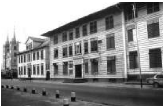
Gravenstraat in Paramaribo (Suriname) with its Cathedral: a fine urban ensemble in wood

The Thematic Expert Meeting on Wooden Urban Heritage in the Caribbean Region was organized by the UNESCO World Heritage Centre in co-operation with the Government of Guyana, the UNESCO Office for the Caribbean in Jamaica and the Organization of the Wider Caribbean on Monuments and Sites (CARIMOS), with financial support from the Netherlands Funds-in-Trust at UNESCO, in February 2003 at Georgetown (Guyana). It was part of a series of thematic studies and related expert meetings involving the Caribbean region, initiated under the Global Strategy Action Plan of the World Heritage Centre, aiming to facilitate the identification, protection, conservation and nomination of specific categories of heritage pertinent to the Caribbean region – in this case the particular type of vernacular wooden architecture as part of larger urban ensembles.